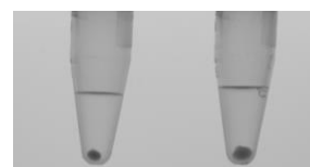
Fig. 1: recommended pellet sizes: Left: max. pellet bacterial size Right: max. pellet size for samples containing yeast or particles